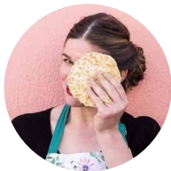
Antje de Vries TV chef & cookbook author